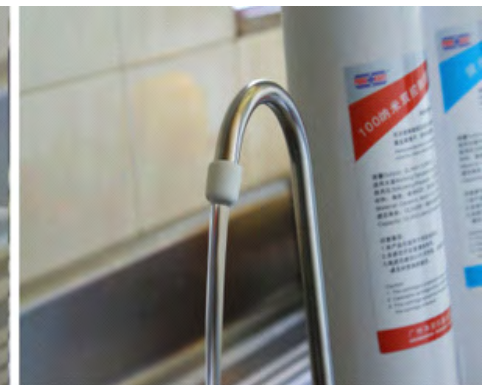
Tap water output